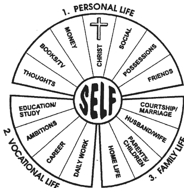
The Self-Controlled Life with Jesus as a Lodger

Jesus does not force His way into our lives, He only comes in by invitation, our opening the door to Him.